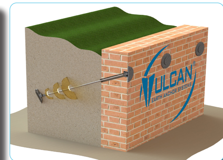
Vulcan EarthAnchor Retaining Wall Solution